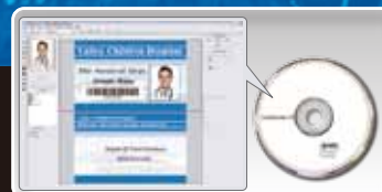
Free Bundled Software