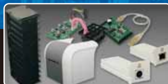
Optional Add-on Modules